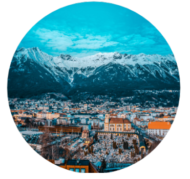
Alpine life quality