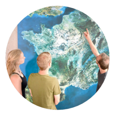
You can find more information about our company at: www.geoville.com