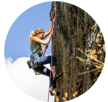
Sports & Leisure