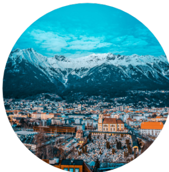
Alpine life quality