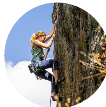
Sports & Leisure